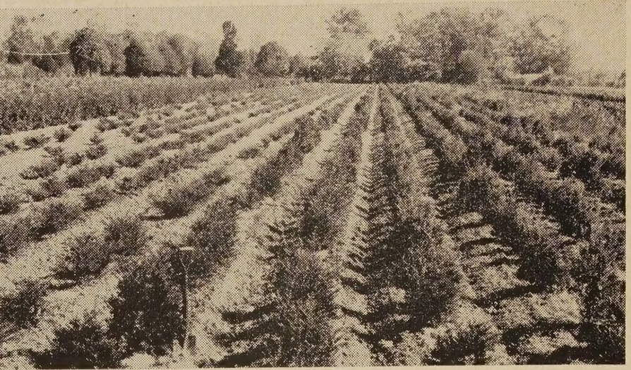
ILEX convexa (left) ILEX microphylla (right)